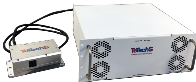
TeraGauge 5000: A compact terahertz measurement gauge