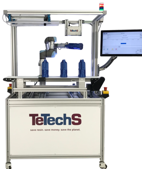
PlastiMeasure 3000: A turnkey thickness measurement solution powered by TeraGauge